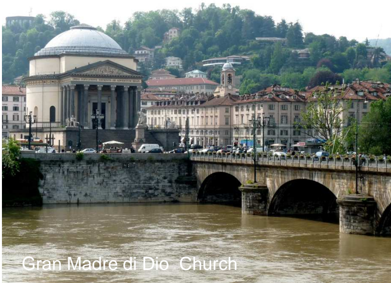
Gran Madre di Dio Church